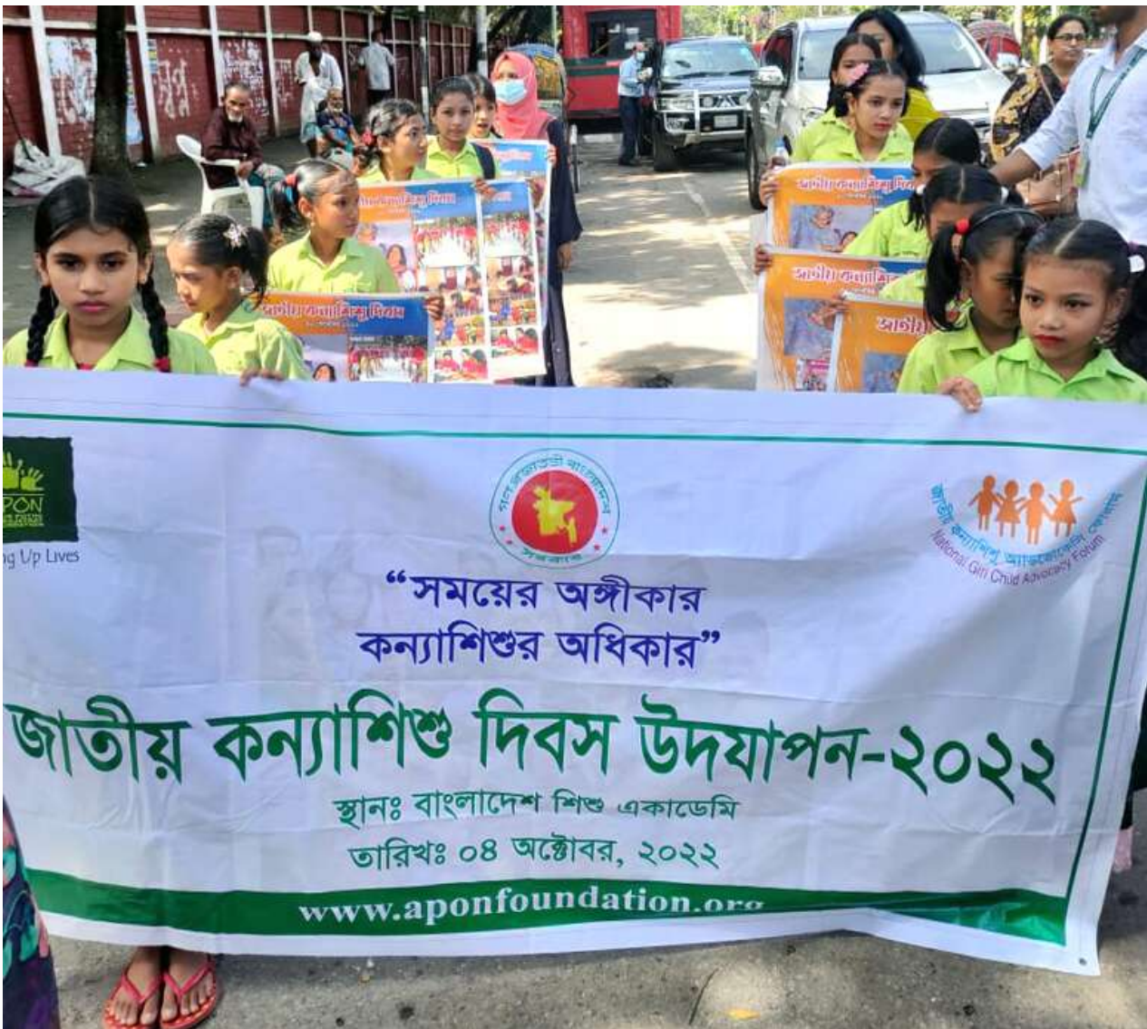
ASF at the National Girl Child Day program organized by National Girl Child Advocacy Forum (NGCAF) in Bangladesh Shishu Academy.